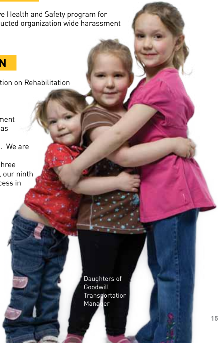
Daughters of Goodwill Transportation Manager

The Council of Accreditation on Rehabilitation Facilities (CARF) came to Goodwill Industries of Alberta to audit our Community Employment Programs and Services, as well as our administrative areas. We are proud to say that we once again gained a three year CARF accreditation, our ninth since beginning this process in 1986.