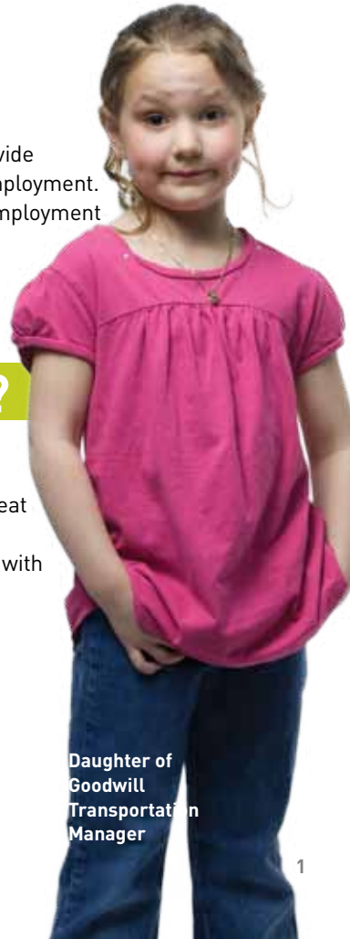
Daughter of Goodwill Transportation Manager

Our customers understand the thrill of the hunt, finding great treasures at great prices. Every dollar spent at one of our retail locations helps support our programs for individuals with disabilities and barriers to employment.